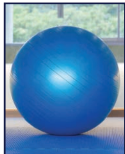
The Blue Yoga Ball